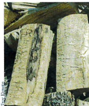
EAB infested ash wood

More information on the emerald ash borer www.emeraldashborer.nj.gov