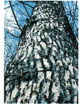
Woodpecker damage on an EAB infested tree